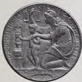
Medal Commemorating the Opening of the Mint Manila, 1920